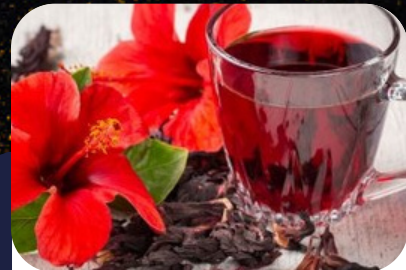
Herbal & Wellness