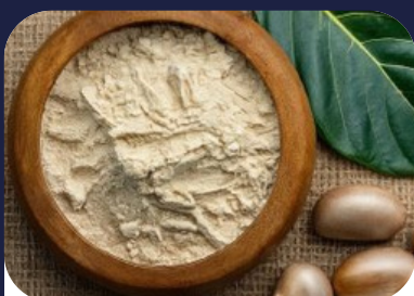
Dehydrated Flour & Powder